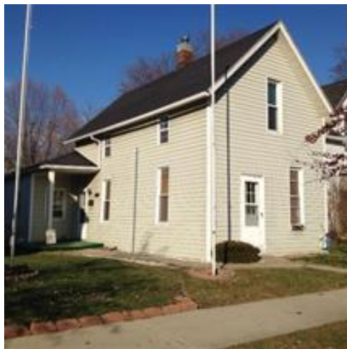
2024 E Market