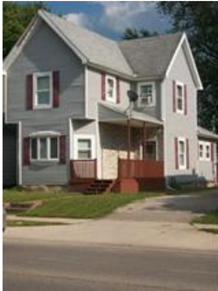
1617 E Market