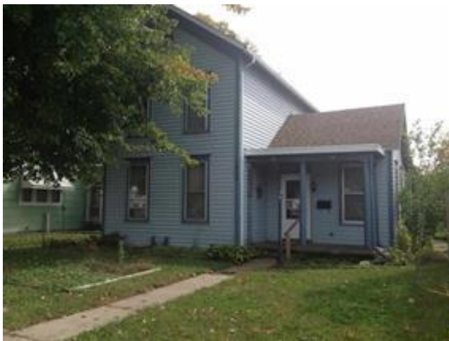
1805 E Broadway