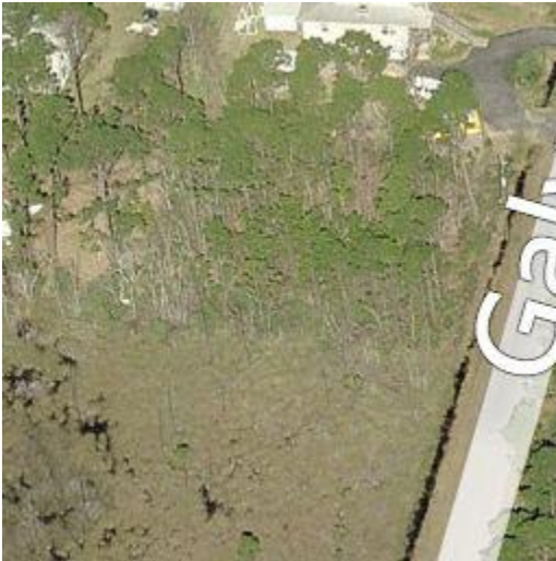
5500 Galvez Rd