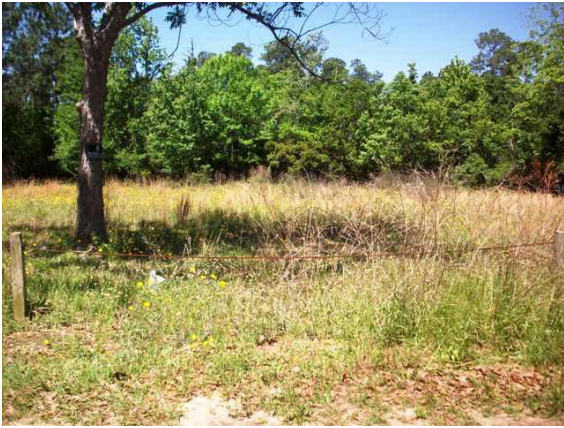
0 Kingsfield Rd