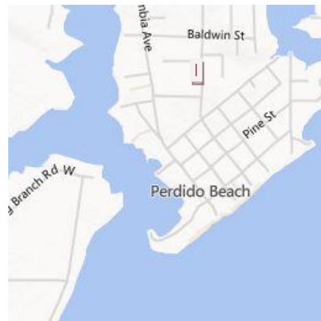
8594 Pensacola Ave