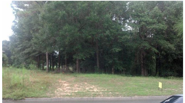
0 Marcus Pointe Blvd