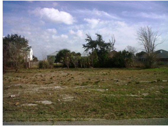
5556 Grande Lagoon Ct