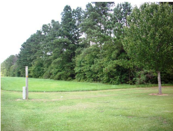
5100 Hwy 97