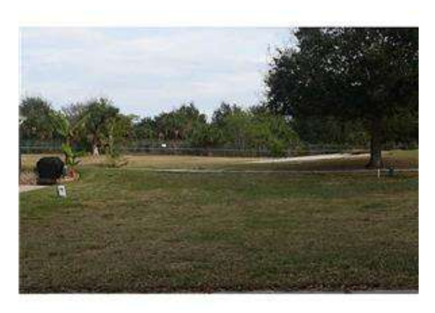
2610 Frontier Dr