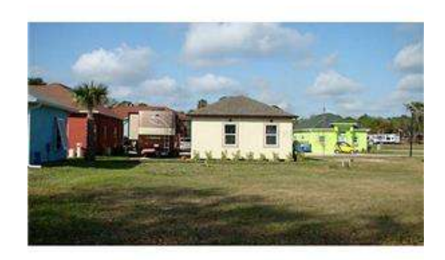
2541 Frontier Dr