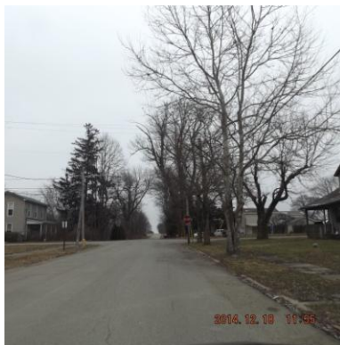
Street View 1