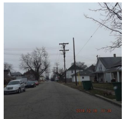
Street View 2