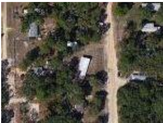
117 Crows Bluff