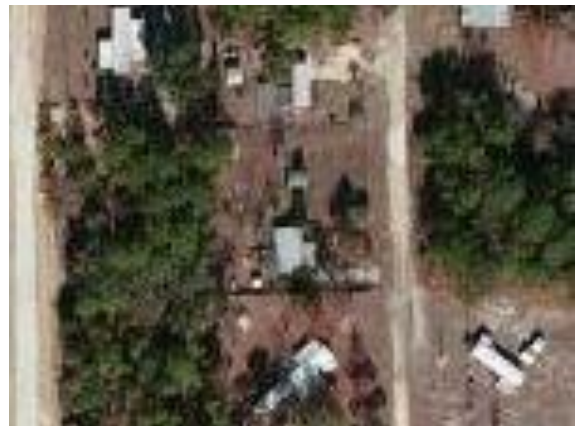
219 High Ridge Rd