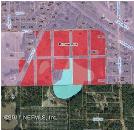
List comp 3