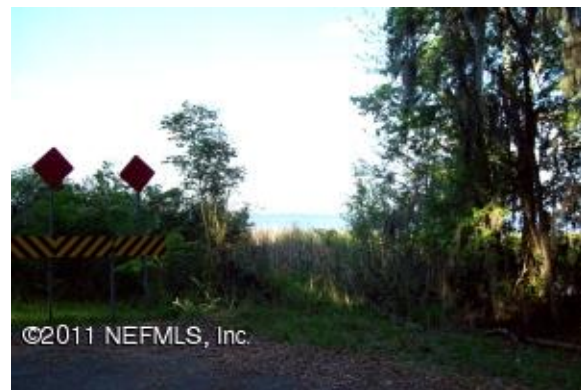
Sold comp 3