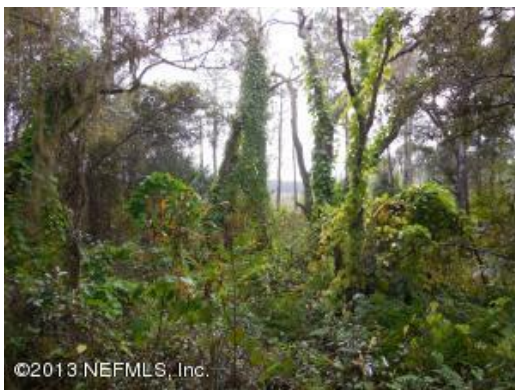
Sold comp 2