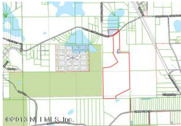
Sold comp 1