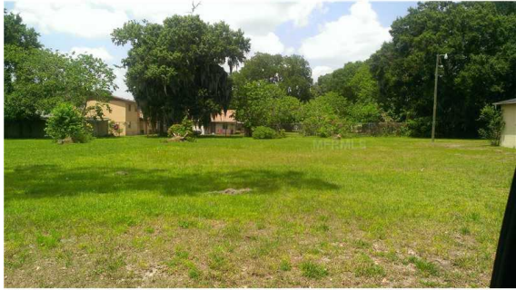
List comp 2