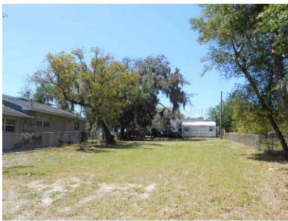
Sold comp 2