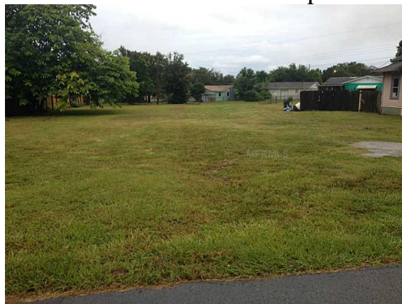
Sold comp 3