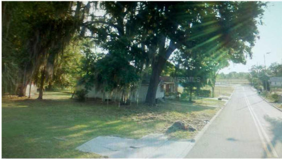
List comp 3