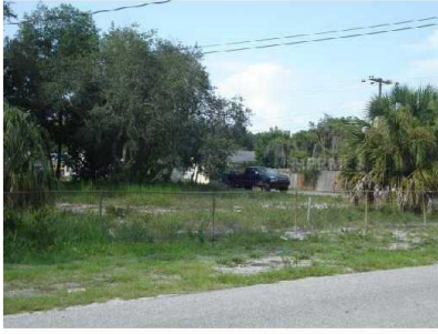
List comp 1