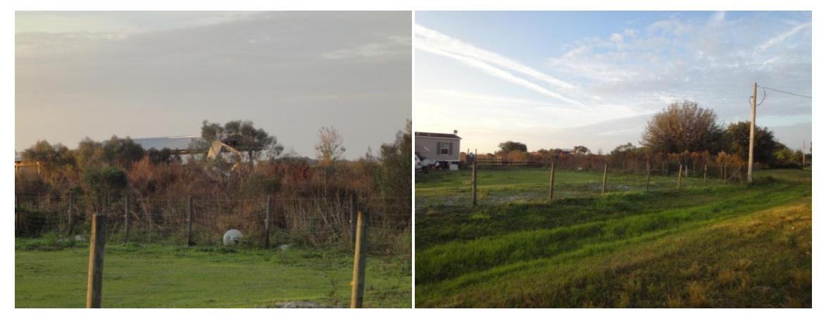
Side view 5X & 1X