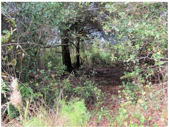
893 NW 115<sup>th</sup>