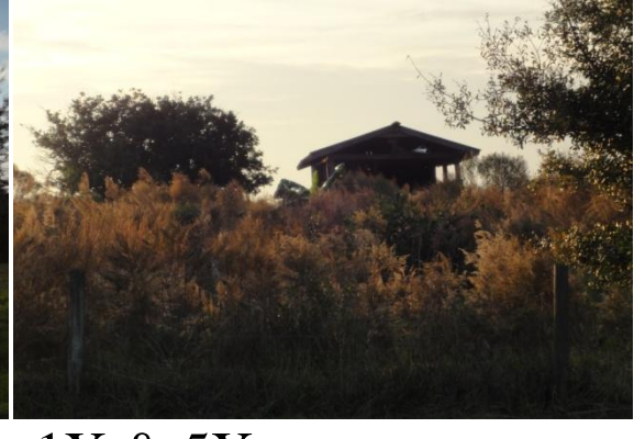
Front view 1X & 5X