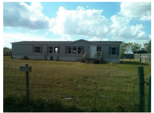
17655 NW 38<sup>th</sup>