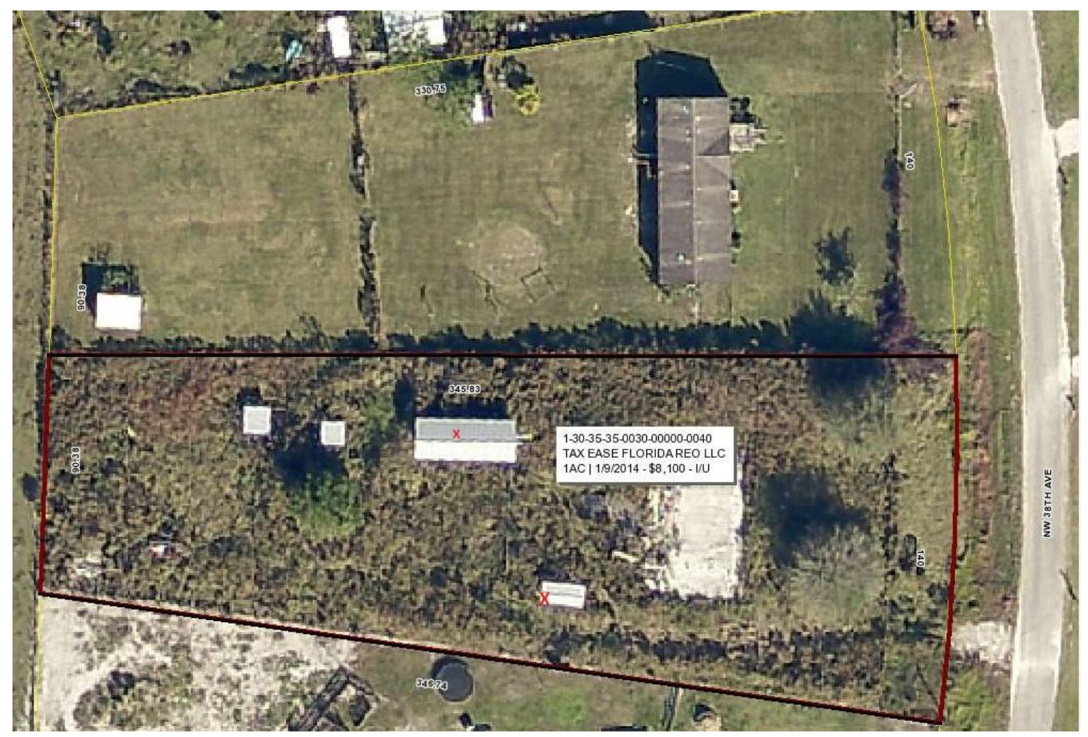
X- structure is still on parcel