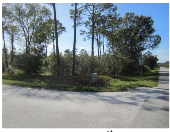
1356 NE 131<sup>st</sup> St