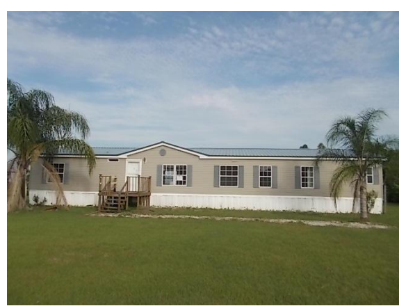
17541 NW 38<sup>th</sup> Ave