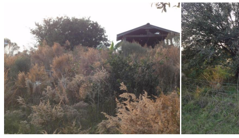
Zoom to covered area