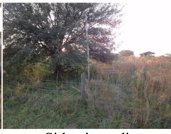
Side view- distant