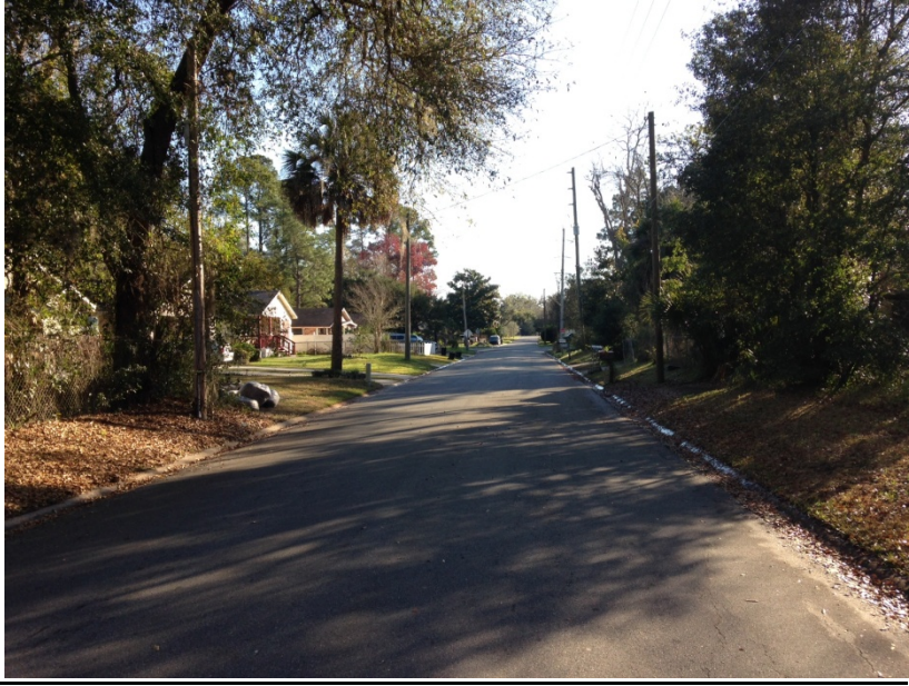
Street View – West