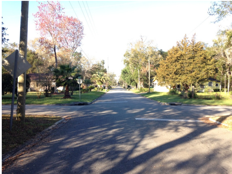
Street View - East