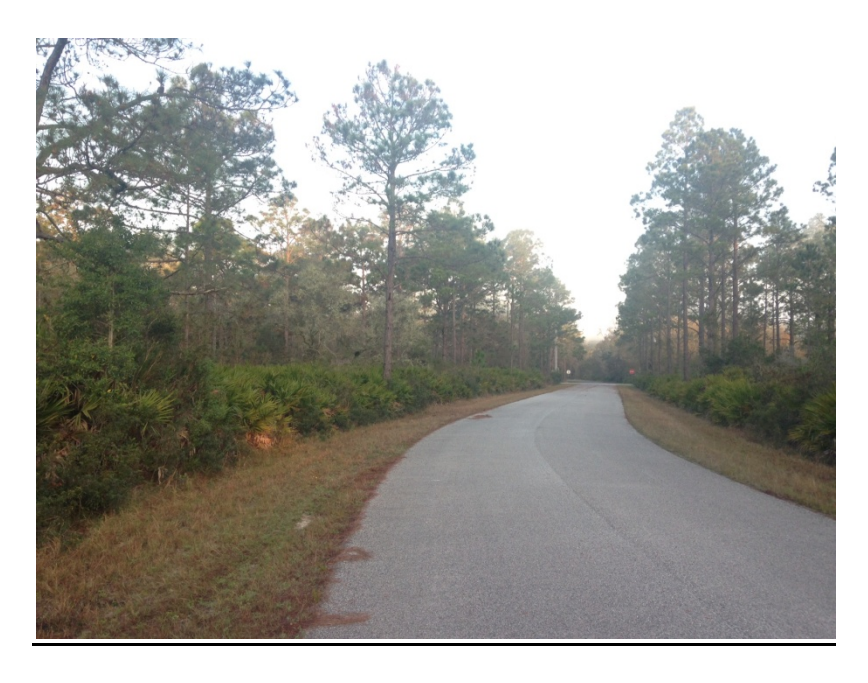
Street View – East