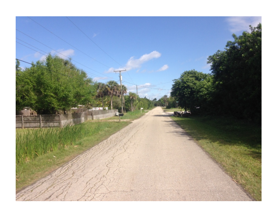
Street View - East