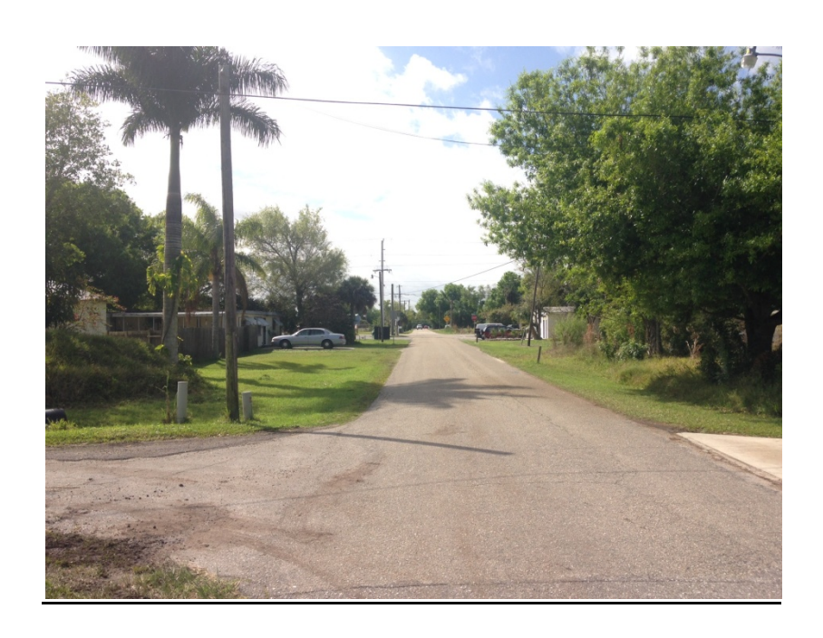
Street View – West